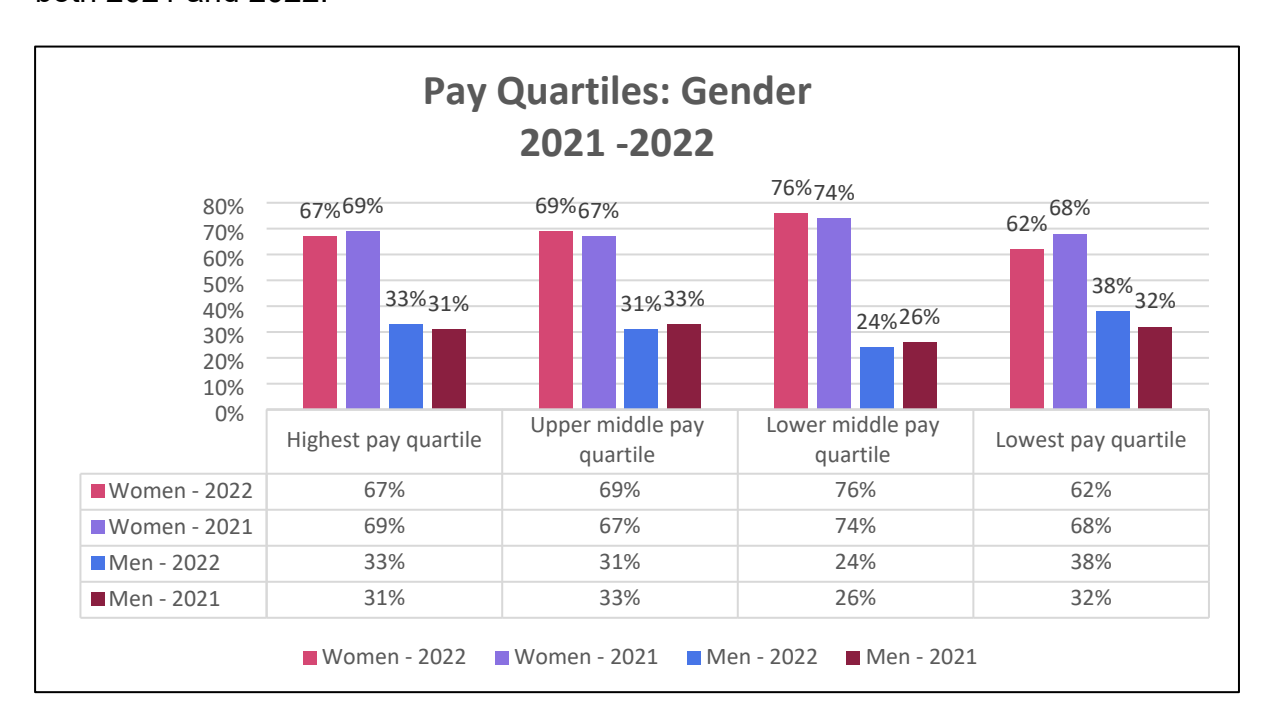
Figure 3: Chart showing pay quartiles for Croydon staff calculated via gender (male and female) in 2021 and 2022

The highest and upper middle (top \frac{1}{2} ) paid quartiles show representation of female employees at similar levels to their workforce representation (68%) for both 2021 and 2022.